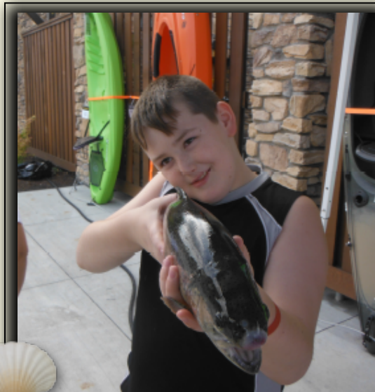
MY FIRST FISH

PAYABLE TO: SEATTLE POGGIE CLUB 16623 56TH PLACE W. LYNNWOOD, WA 98037