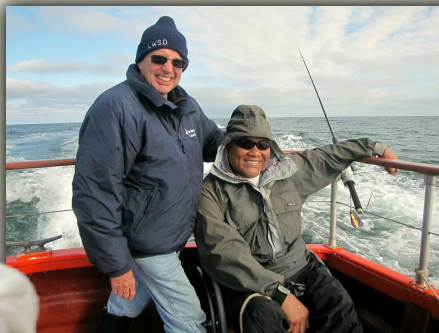
Poggies at Ilwaco

VISIT US AT OUR GENERAL MEETINGS 6:30 PM EVERY THIRD WEDNESDAY OF THE MONTH AT: