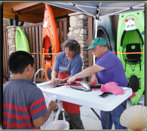
Teaching the Fisherman of the Future