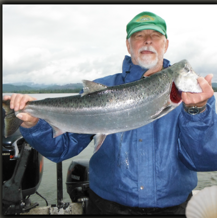
Columbia Spring King